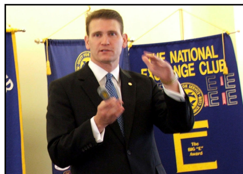
Sugar Land Mayor David Wallace told Exchange members about Sugar Land's accomplishment and why SL is one of the top ten cities in which to live.