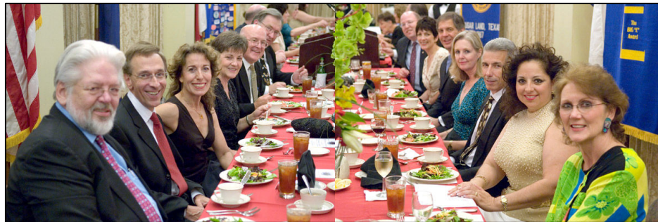
Distinguished members and guests at the head table.