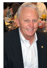
Sugar Land Mayor Jimmy Thompson