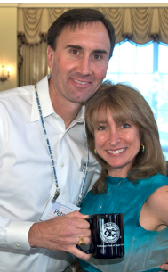
Representative Pete Olson