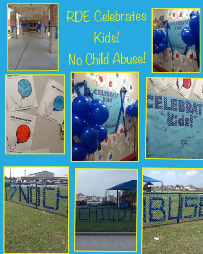
Third - Baines Middle School