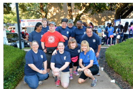
Exchange Club of Rosenberg