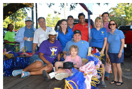
Exchange Club of Fort Bend