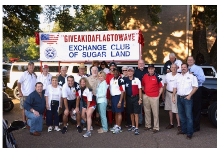
Exchange Club of Sugar Land