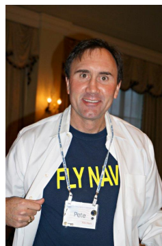
Congressman Pete Olson