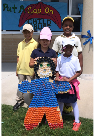
"Put a Cap on Child Abuse." Students made "children" using bottle caps.