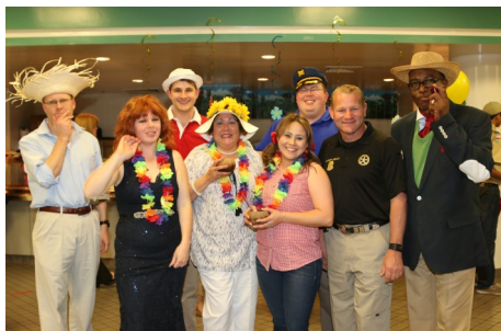
3rd Place Fort Bend County Sheriffs