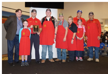
2nd Place Sugar Land Fire Dept.