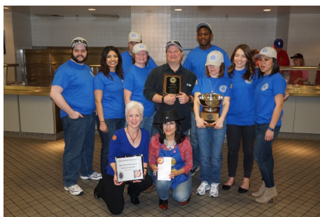
1st Place Sugar Land Police Dept.