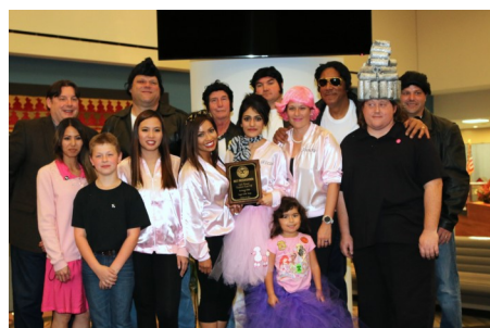
Best Presentation FB ISD Police