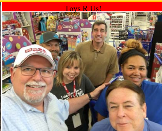
Toys R Us!