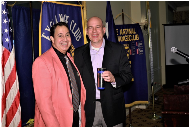
He got mugged for something he said, and he thinks it's funny.