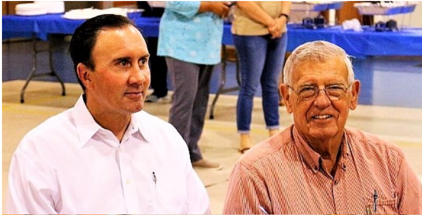
Congressman Pete Olson (R-TX) attending the Boy Scout pancake breakfast with