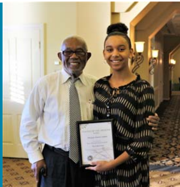
Grandfather Proudly Stands!