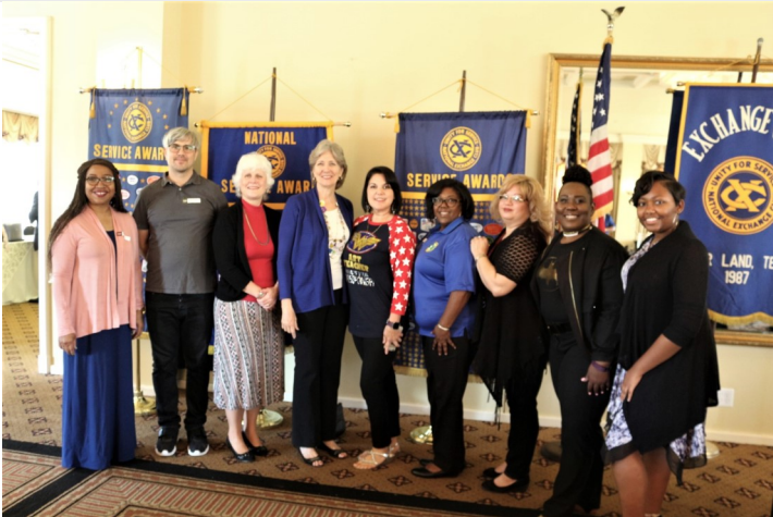
E. A. Jones Elementary / FIRST PLACE

This was a contest between the FBISD schools to come up with the best presentation for child abuse prevention, the month of April. Three schools placed 1st, 2nd, and 3rd...$500, $400, & $300 in that order. Their competition was working with blue ribbons to come up with a concept for child abuse prevention. "All were winners"