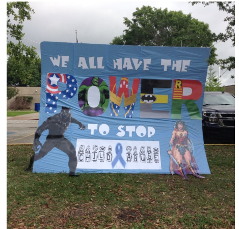
Missouri City Middle School/THIRD PLACE

Every Child is a Unique Piece and When We Come Together Our Family is Complete... "Together We Can Stop Child Abuse!"