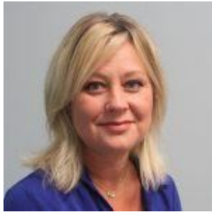
Development Officer B.A., Journalism