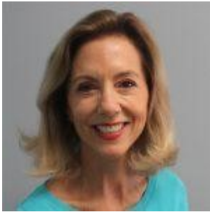
Chief Executive Office B.A., Psychology; M.B.A.