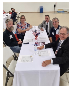
One Nation Under God Luncheon Angleton

Exchange celebrates religious freedom, sovereign authority over our political framework, and the special standing of America in the world. We also honor our Veterans, protectors of this right.