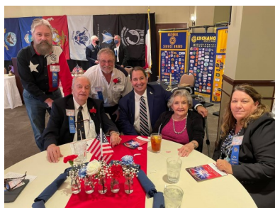
One Nation Under God Luncheon Missouri City

Congress shall make no law respecting an establishment of religion, or prohibiting the free exercise thereof.