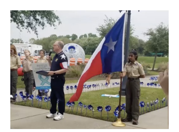
Light of Hope Ceremony