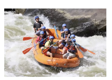
White Water Rafting