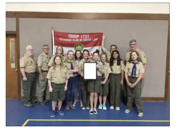
Troop 1731 Charter Presentation

Both Scout troops have been busy this year, even with the lockdowns. What have they been up to?