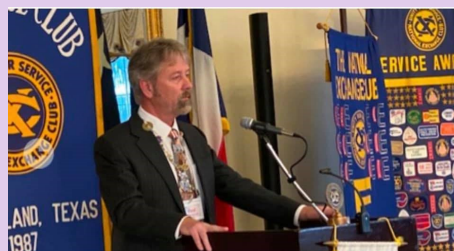
Current Past President July 1st 2020 - June 30th 2021