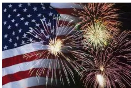
Happy Fourth of July