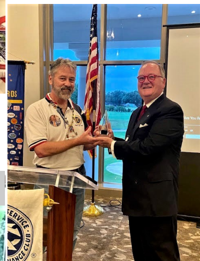
True Leaders! Both received the Berkey Award Pin!