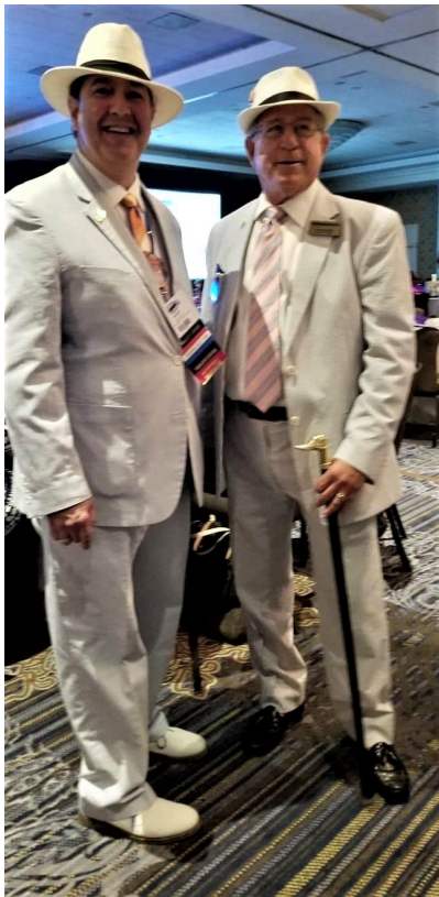
Dapper young men? at National Convention!