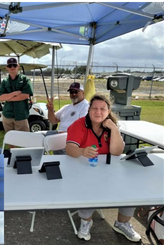
Wings Over Houston