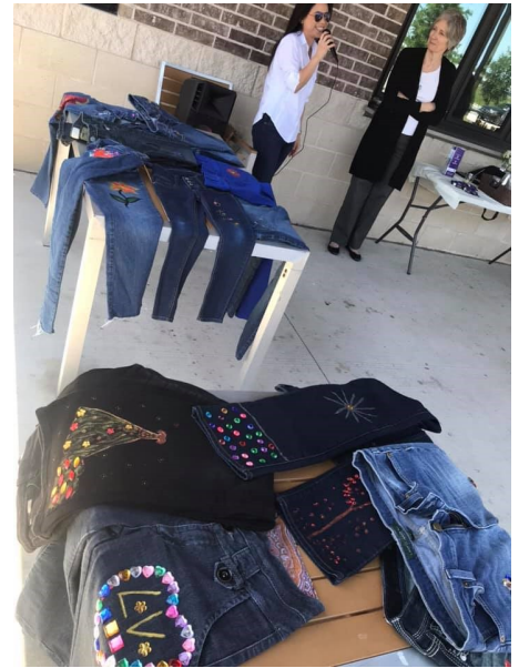
What a great Project!