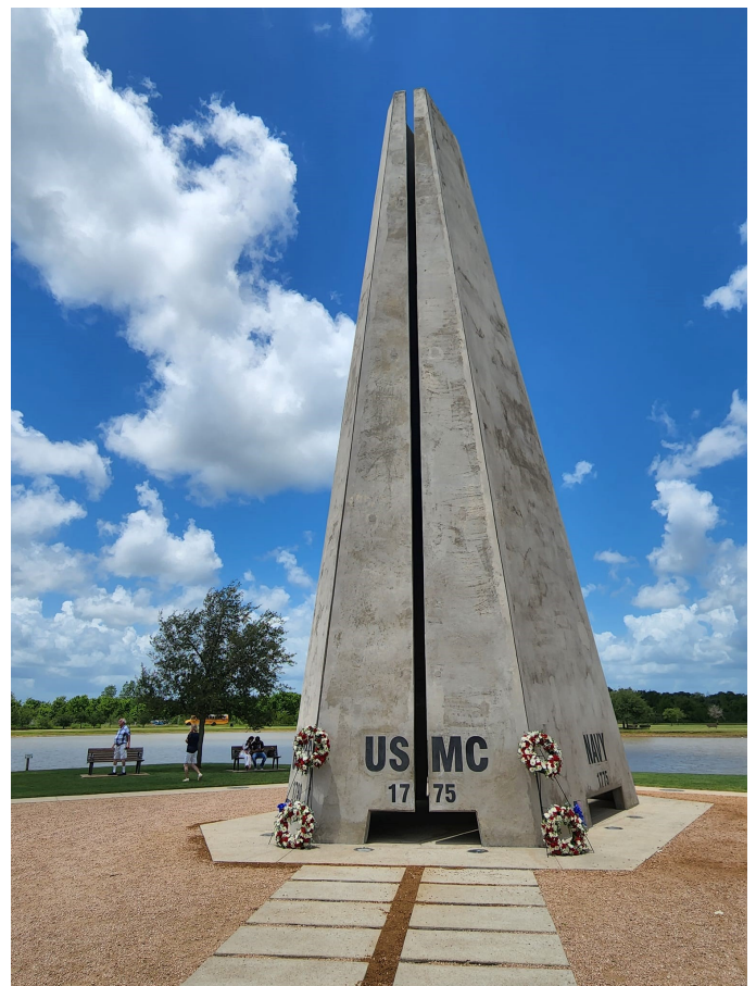
Sugar Land Memorial Park