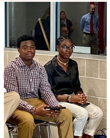
Retired Congressman Pete Olson, and two students that spoke at the installation.