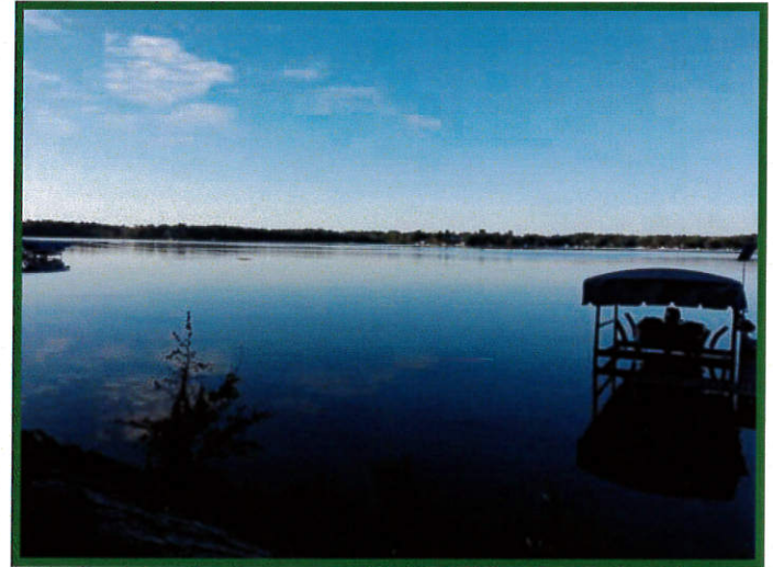
Oconomowoc Lake at Dusk

ADAPTIVE MANAGEMENT Take the PLUNGE toward CLEAN WATER