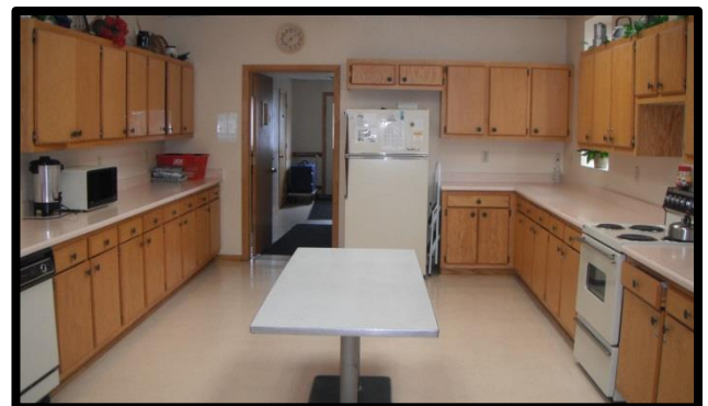
Large counter space with serving window. Tableware to serve up to 80 people including silverware, salad plates, dinner plates, coffee cups, and water glasses.