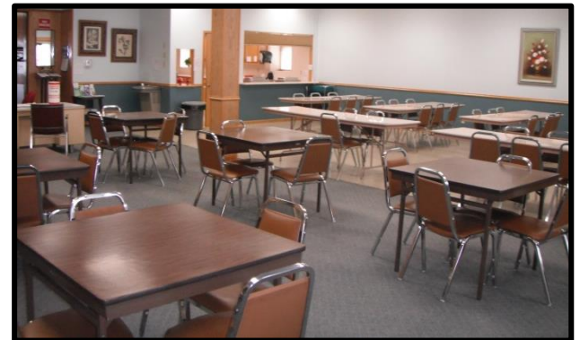
Large space with 17 tables and seating for 80 people